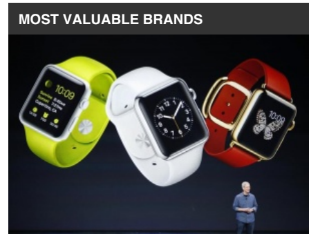
The 50 most valuable brands in the world.

Both organizations intended for the survey to gather the opinions of overseas Americans on the issues that impact them most. One clear message the data reflected was the growing frustration with US tax laws, such as Foreign Account Tax Compliance Act (FATCA), a major US initiative to uncover US taxpayers hiding money overseas to avoid paying American taxes. FATCA requires individuals to report their offshore assets if they exceed certain thresholds and foreign financial institutions are now required to report information about the accounts of their American clients to the US. This reportedly is resulting in banking issues for US expats, as some foreign financial institutions are choosing not to do business with Americans to avoid the hassle of FATCA's special due diligence and reporting requirements.